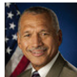
Charles F. Bolden Administrator, NASA