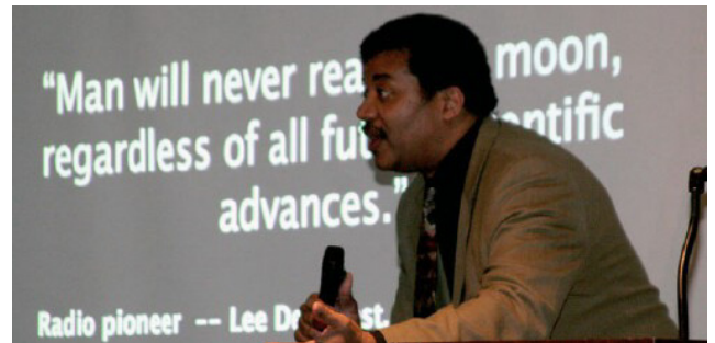
Dr. Neil DeGrasse Tyson at the 2006 ISDC

This year sees the advent of the 30th annual International Space Development Conference, to take place from May 18-22, 2011 at the Von Braun Center in Huntsville, Alabama. The theme for this year’s conference will be “From the ground up ... how do we get there?” – a reference to NSS’s ongoing local, regional, national, and international efforts to foster our growth as a spacefaring civilization. Furthermore, it is a pragmatic question that the conference programming – including summits, symposia, workshops, and networking opportunities – means to address by engaging a diversity of professionals with each other and the prevalent issues to create synergy, stimulate innovation, and overcome the obstacles that hinder human advancement off the Earth. For details on previous ISDCs go to isdc.nss.org